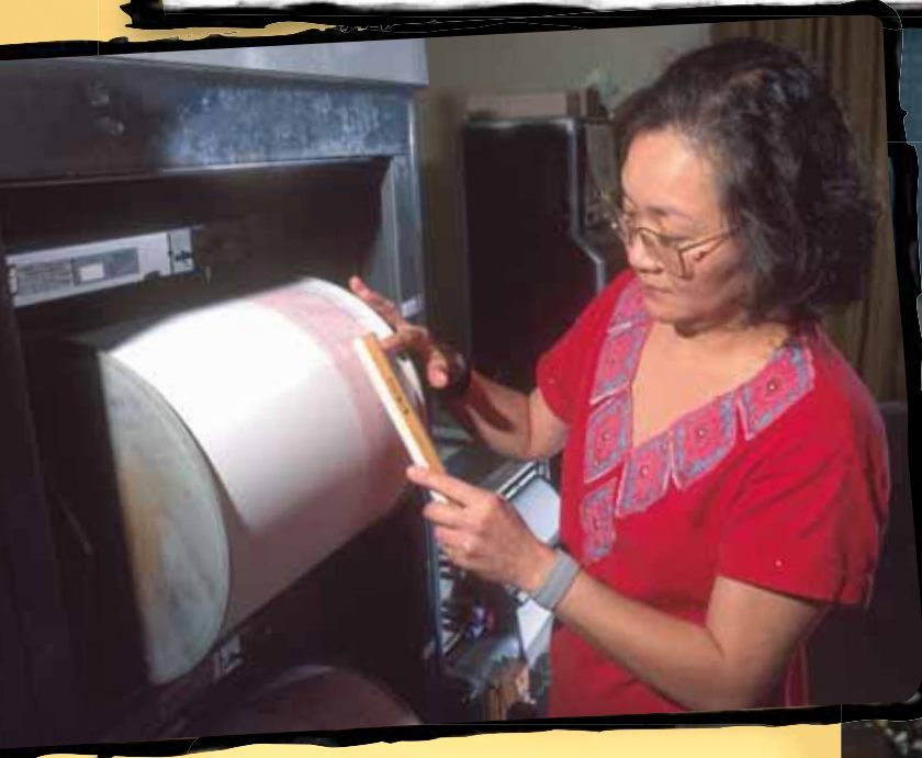
This seismologist is measuring the movements on a seismometer.

Seismologists (size-MAWL-uh-jists) study earthquakes. They predict where big earthquakes may occur.