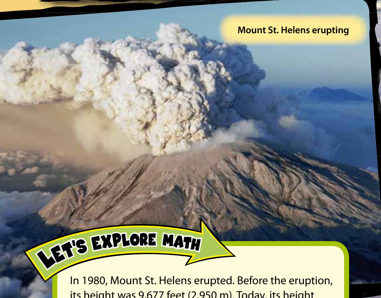
Mount St. Helens erupting

But the data from these instruments is not always helpful to volcanologists. Some eruptions just cannot be predicted.