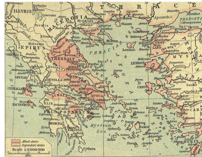
◀ Map of ancient Greece